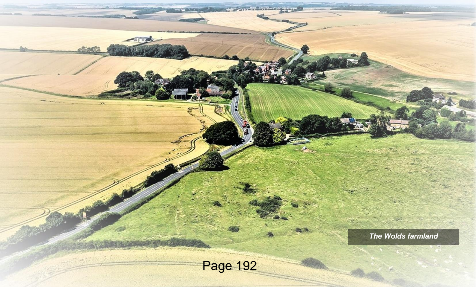
The Wolds farmland

The Committee also referred to 'plastic-free communities', where individuals were working with communities and businesses to encourage them to reduce plastic waste. Following a recommendation from the Executive, the Green Master Plan was adopted by the County Council in February 2021.